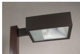
Floodliner 2 LS 33FL2