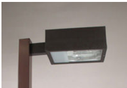
Floodliner 1 LS 33FL1